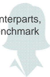
What percent of income should your neighbors be giving to charity?

Compared to their male counterparts, women responded with a benchmark that was 30% higher